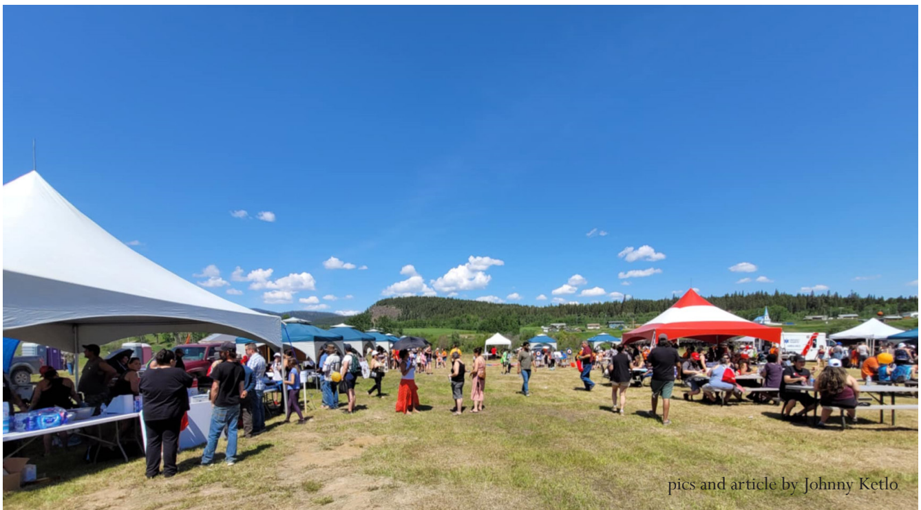
pics and article by Johnny Ketlo

The day concluded with a heartwarming closing ceremony, where Elders offered blessings and emphasized unity and cultural preservation. Indigenous Day 2024 in Nadleh Whut'en was a memorable celebration of heritage and community.